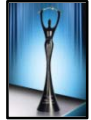
Electra Award 2005