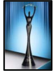
Electra Award 2005